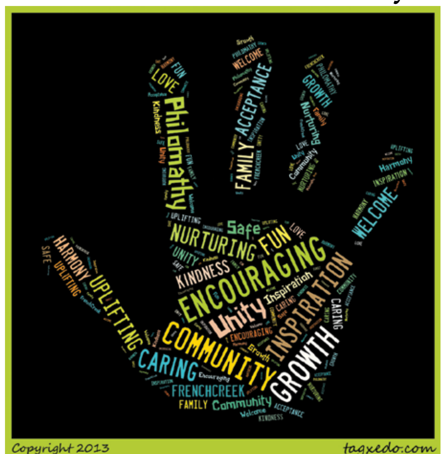
Above is word art created with words teachers used to describe French Creek Elementary School. The art was featured on the cover of the employee newsletter.