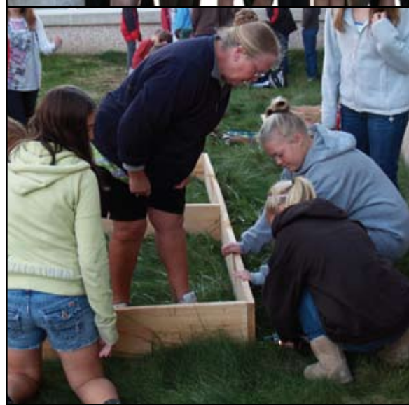
(Left) Middle school students and volunteers install gardens for Chester County Food Bank. The gardens will be used for hands-on science exploration and nutrition lessons. At least 60% of the food grown will be donated to the Chester County Food Bank, increasing access to fresh foods by those in our District who are in need.